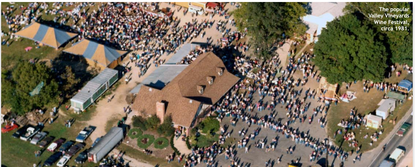
The popular Valley Vineyards Wine Festival, circa 1981.

Great wine is more than taste on your palate... it's warmth in your soul.