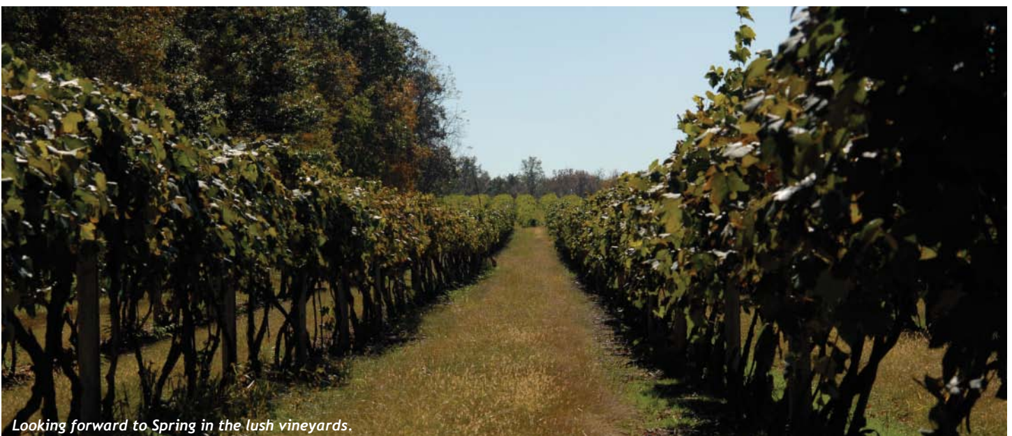
Looking forward to Spring in the lush vineyards.