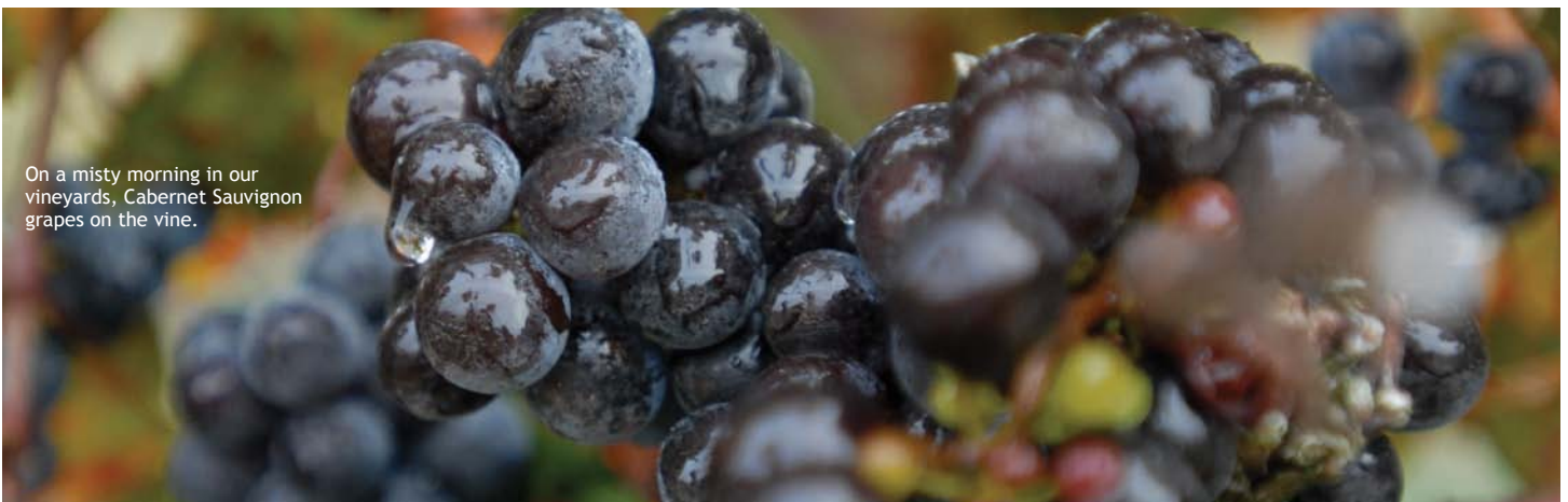
On a misty morning in our vineyards, Cabernet Sauvignon grapes on the vine.

Great wine is more than taste on your palate... it's warmth in your soul.